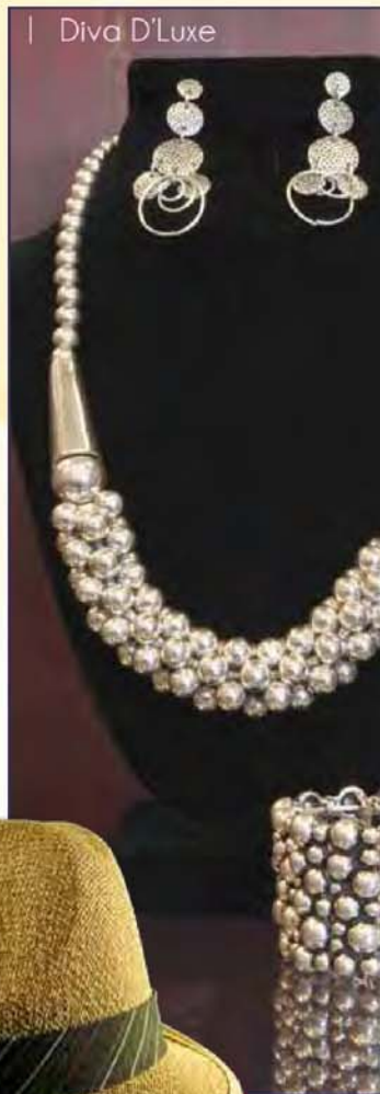
| Diva D'Luxe